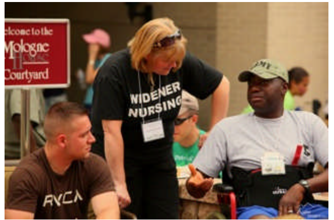
Wounded Warriors at the Katz Deli Luncheon