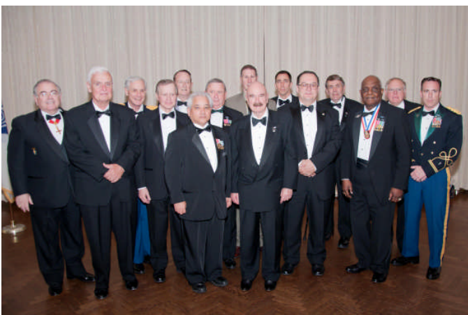
Chapter XI members with G. Gordon Liddy