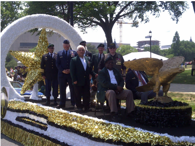
Chapter XI members at Memorial Day Parade